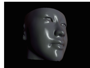
Figure 3: Synthesized face image.